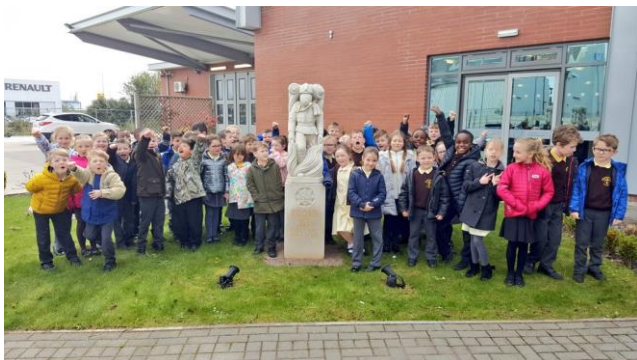
Year 2 visit to the fire station